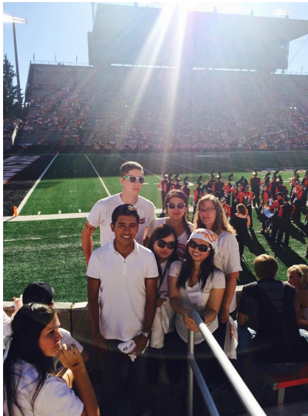
TRiO SSS Peer Mentor Work Schedule Fall 2015

The TRiO SSS Peer Mentor Program is there to support new TRiO-SSS participants by pairing them with upper class students who have similar majors and interests. TRiO-SSS Peer Mentors will assist students with their transition to the university by connecting students to the broader campus community and resources.